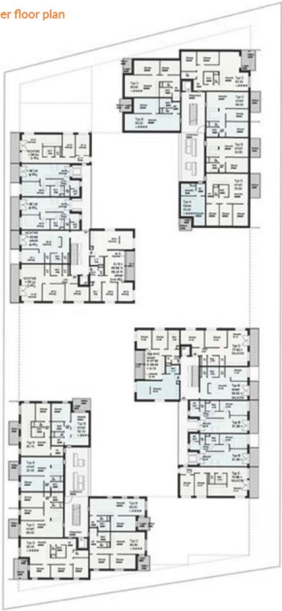
Upper floor plan